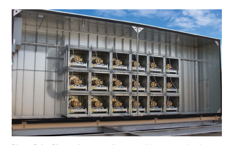
Direct-Drive Plenum fan arrays allow up to 100 percent redundancy for greater systems reliability and up to 10 percent increased efficiency.