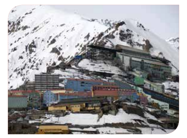
CODELCO (Santiago, Chile)

The RTAC works with low-power thermal storage systems, making ice at night when the utility companies charge less for electricity. The ice tank complements, and can even replace, mechanical cooling during the day when electricity rates are at their highest. In addition, the RTAC can often make ice with the same (or better) efficiency as producing water at 6.5 °C (44 °F) during the day. This is due to lower ambient temperatures during the night, when the ice is made.